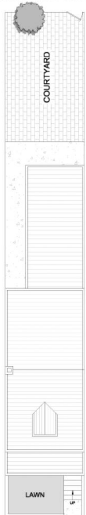
SITE PLAN (at reduced scale)