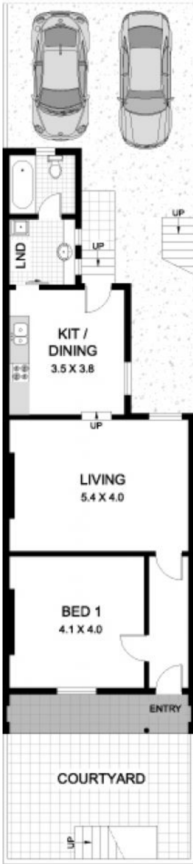
LEVEL 1 (Unit 1)