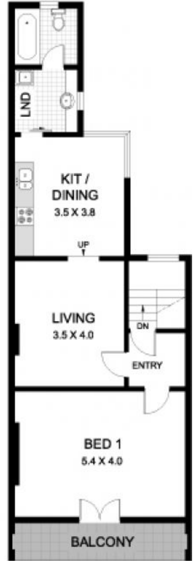
LEVEL 3 (Unit 3)