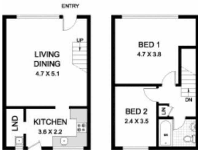
TYPICAL TOWNHOUSE (Units 4, 5, 6, 7, 8, 9)