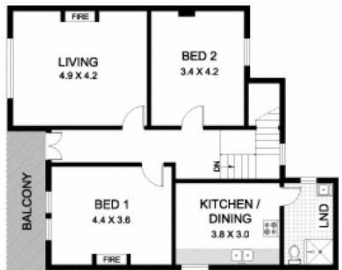
UNIT 3 (Level 2)