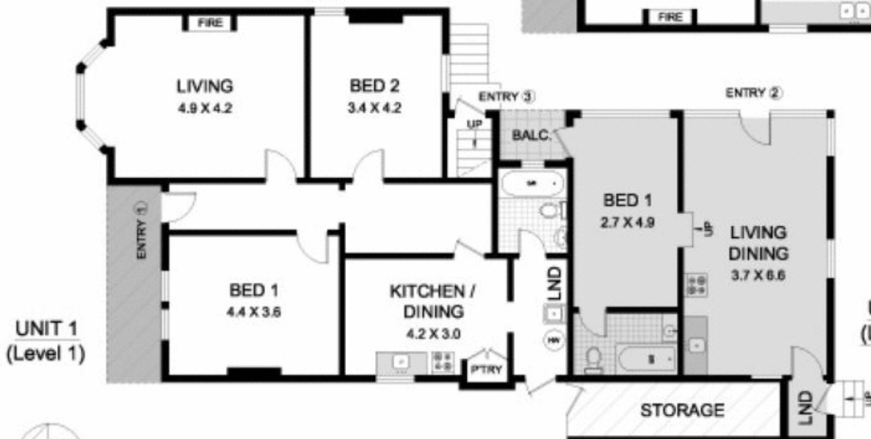
UNIT 1 (Level 1)